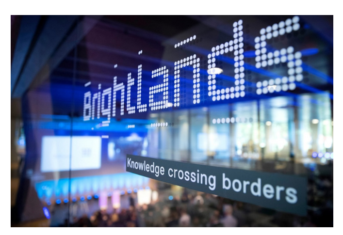
Action 2: Development and implementation of Confi-Dens mini programme

The co-operation between Brightlands Materials Center (BMC) in Limburg and Fraunhofer IMWS in Saxony-Anhalt is a direct result of the S3Chem project. The organisations were introduced to each other following the site visit of partner regions to the Brightlands Chemelot Campus in September 2016. By organising the meetings in Limburg as part of the S3 Chem project, stakeholders of both regions got to know each other and their know-how in the chemical sector. BMC and IMWS were both looking for new developments, and by talking further, also as part of S3Chem events in Barcelona and Halle (D), they discovered that they could enforce each other's developments by cooperation. BMC and IMWS believe that combining their capabilities will bring the development of fiber-reinforced 3D printing a significant step forward, and will also further