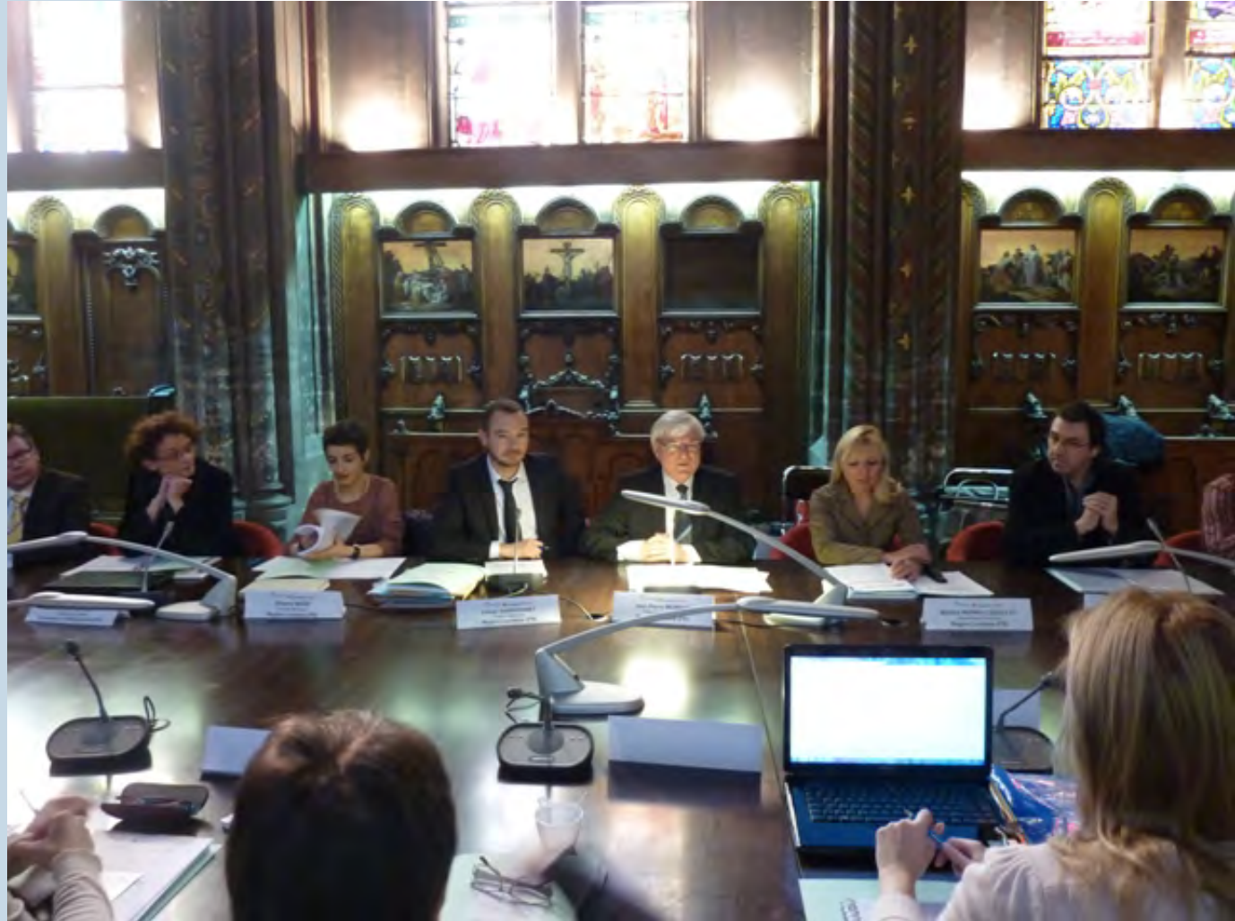
11&12 March 2012 Metz opening seminar at the Hôtel de la Région Lorraine