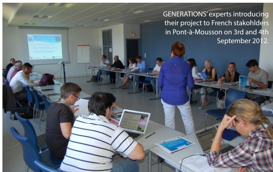
GENERATIONS' experts introducing their project to French stakeholders in Pont-à-Mousson on 3rd and 4th September 2012.