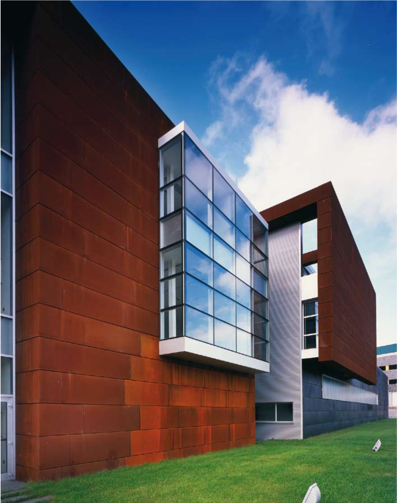
Steel Technology Centre.