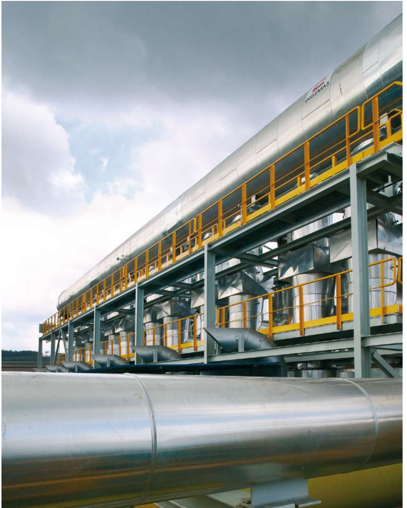
ArcelorMittal: SIDERGAS cogeneration plant.