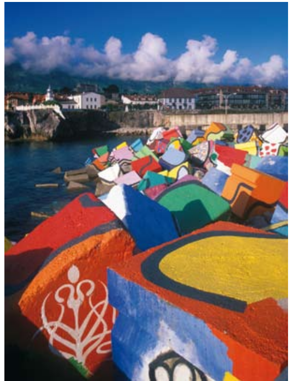
The Cubes of Memory (Llanes) by Agustín Ibarrola.